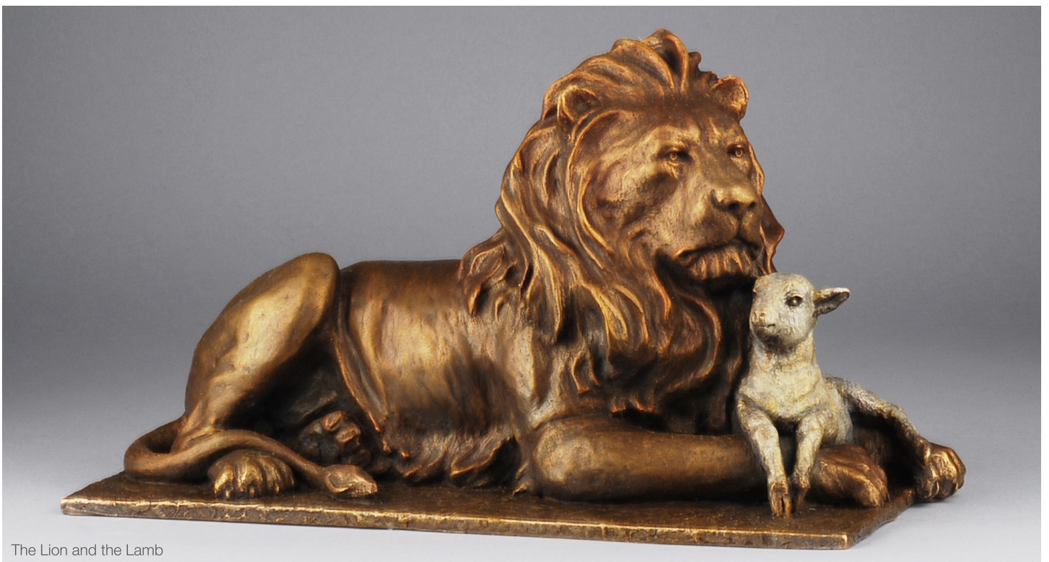
The Lion and the Lamb