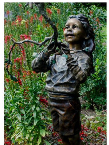
Friends in High Places