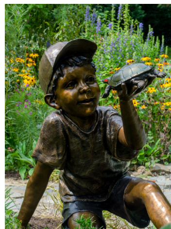
Face to Face