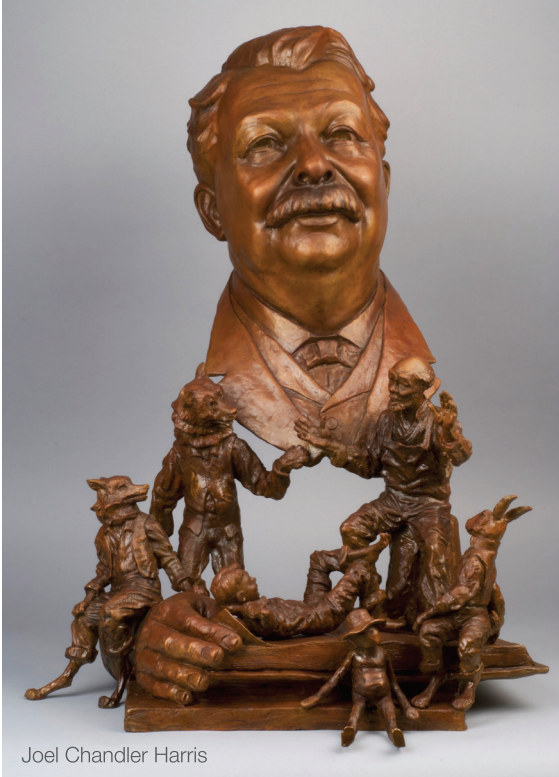
Joel Chandler Harris