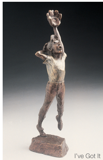
I've Got It

myself! To buy three was incredibly more than I wanted to spend, but I just had to do it. We still have these pieces. Over all these years, they have been special to my husband as well as my children. What fun they had in presenting him with his gift that year! And, of course, in time they will be passed down, one to each son."