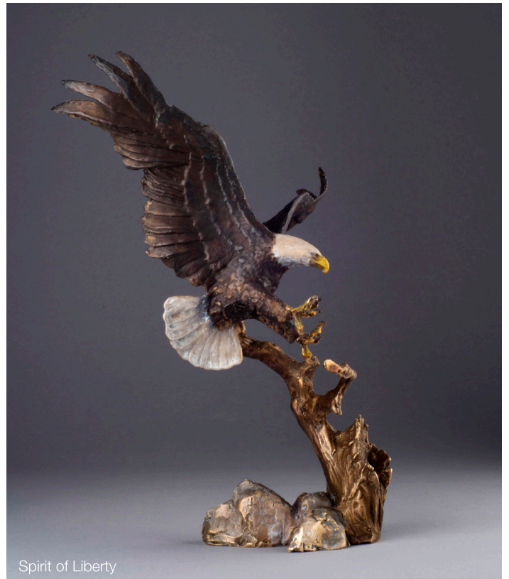
Spirit of Liberty

The second new bird might be diminutive, but it is packed with magnificent power. The Spirit of Liberty measures 9 inches from wingtip to wingtip, and is similar in style to one of Mark's long sold-out eagles. This new sculpture will be a favorite with patriots, boy scouts, pilots, and anyone who loves eagles.