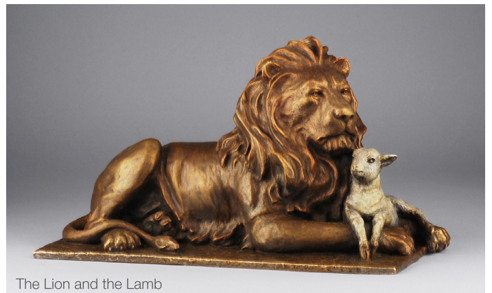
The Lion and the Lamb

Lastly, we are introducing a smaller version of The Lion and the Lamb , which has appealed to many in search of a beautiful symbol of peace and hope in their lives. At half the original size, this sculpture measures 6 inches long.