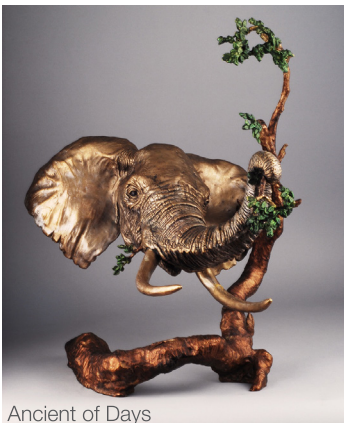
Ancient of Days