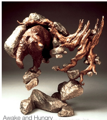
Awake and Hungry Sculpture, Inc.