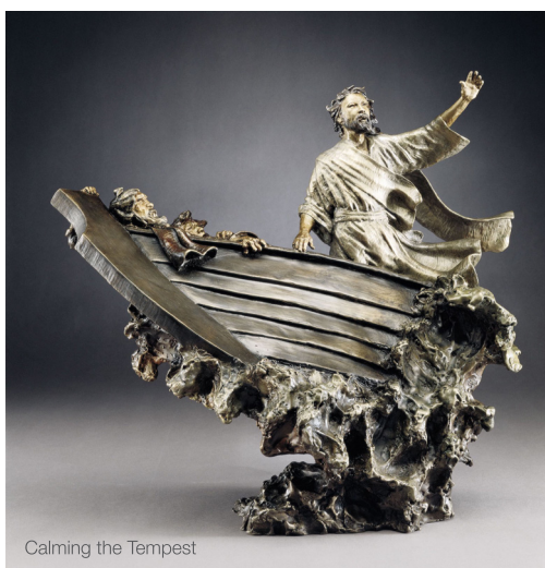
Calming the Tempest