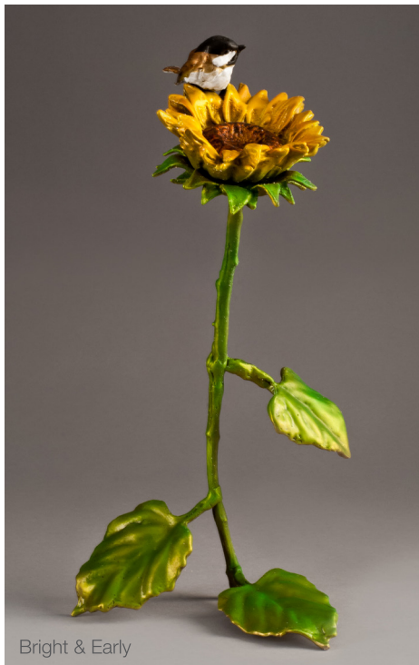
Bright & Early