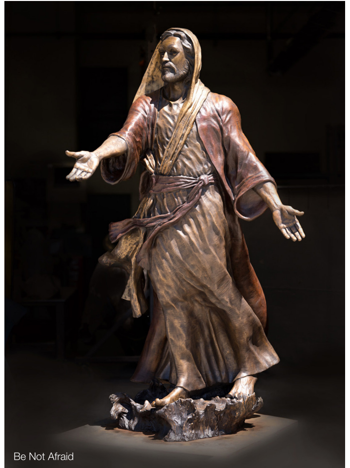
Be Not Afraid

Several other beautiful pieces are in the works, including a brand new portrait of the Savior. This piece, to be entitled The King , will be a powerful portrayal of the suffering of Jesus Christ in his final hours.