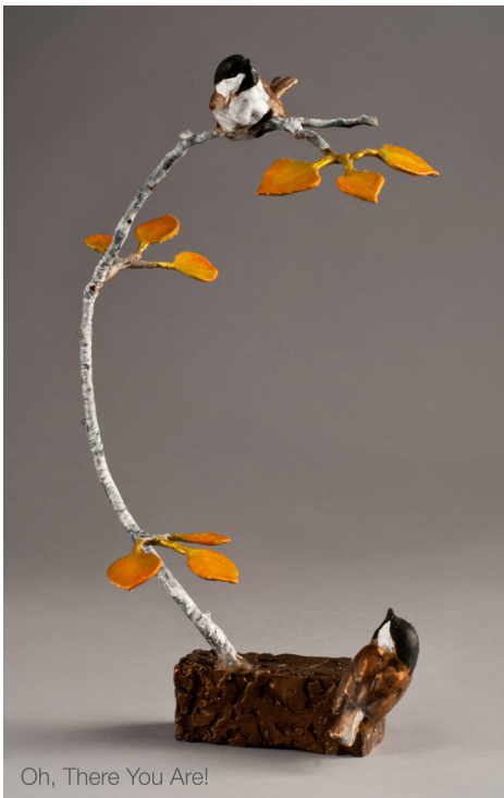
Oh, There You Are!