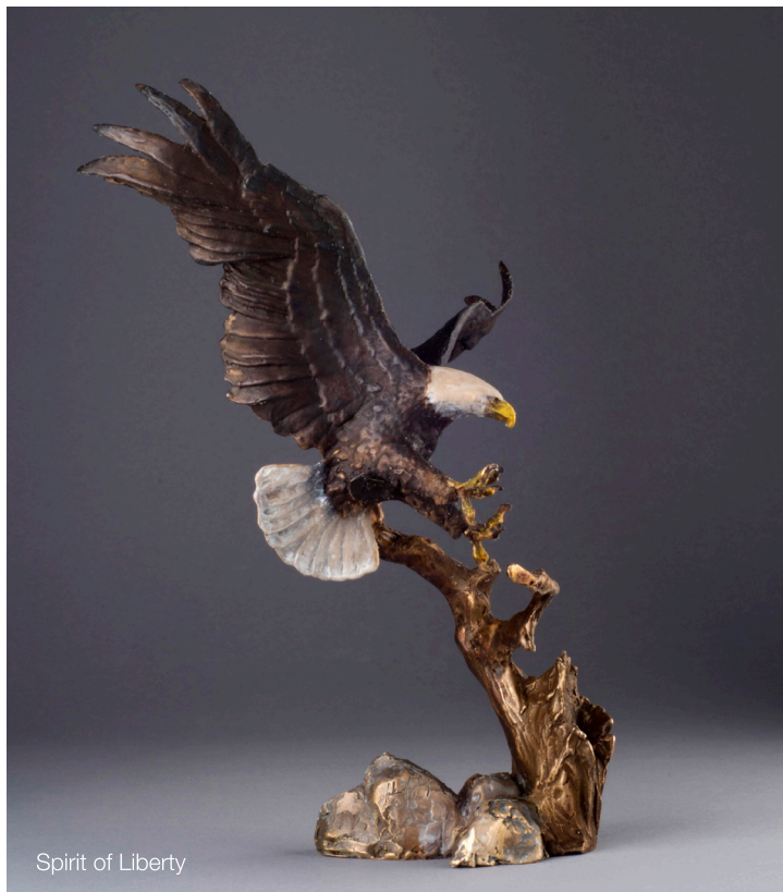
Spirit of Liberty

The price of freedom is eternal vigilance. It is true for the wild creatures of the earth, and true for the nation that holds dear its liberty. With that theme in mind, Mark's Spirit of Liberty is now available in a larger size. The new 18" version has really taken flight! This magnificent eagle resonates with everyone who loves either wildlife or this great nation - or both.