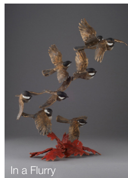
In a Flurry

We are excited about a new pair of birds coming in the spring. This sculpture will depict a lovely twosome of doves with an olive branch, the quintessential symbol of love and peace.