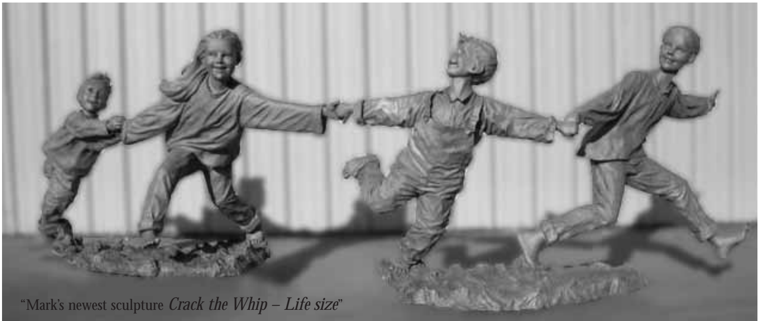
"Mark's newest sculpture Crack the Whip – Life size"