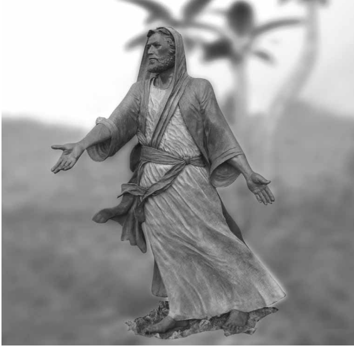
Be Not Afraid (Monument)