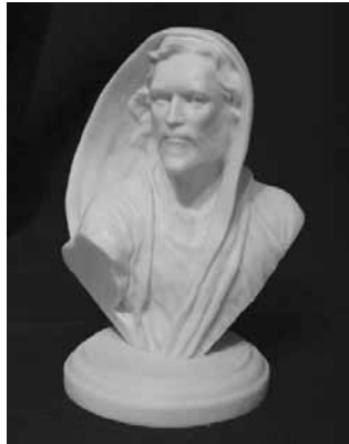
Jesus Christ (Bust)