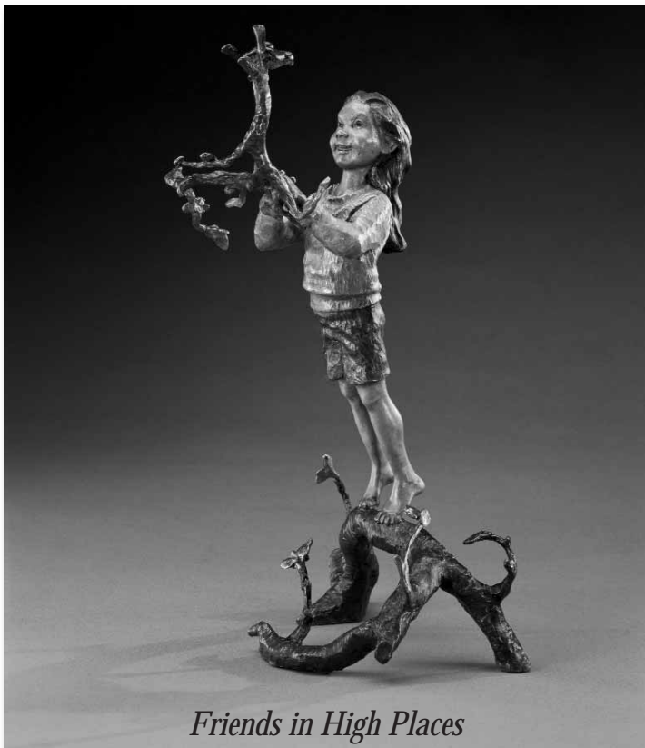
Friends in High Places

Friendship of a different sort is portrayed in Friends in High Places (large). In this charming children's work, a curious young girl pauses while climbing a tree to make the acquaintance of some of its residents, and enjoy one of the precious miracles of life.