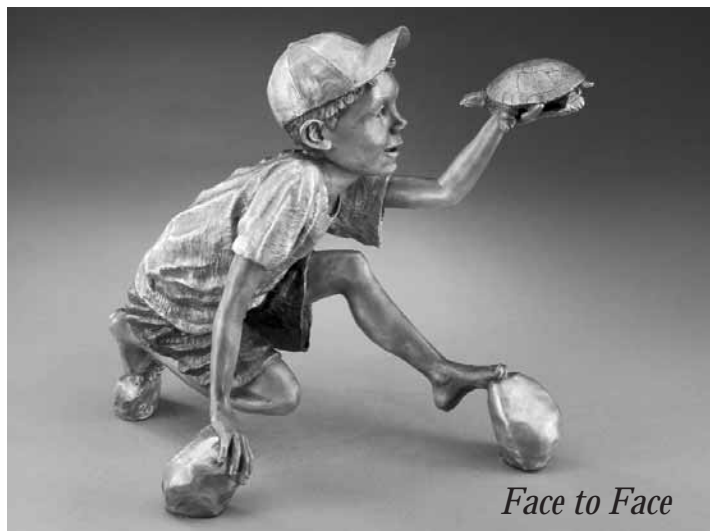
Face to Face