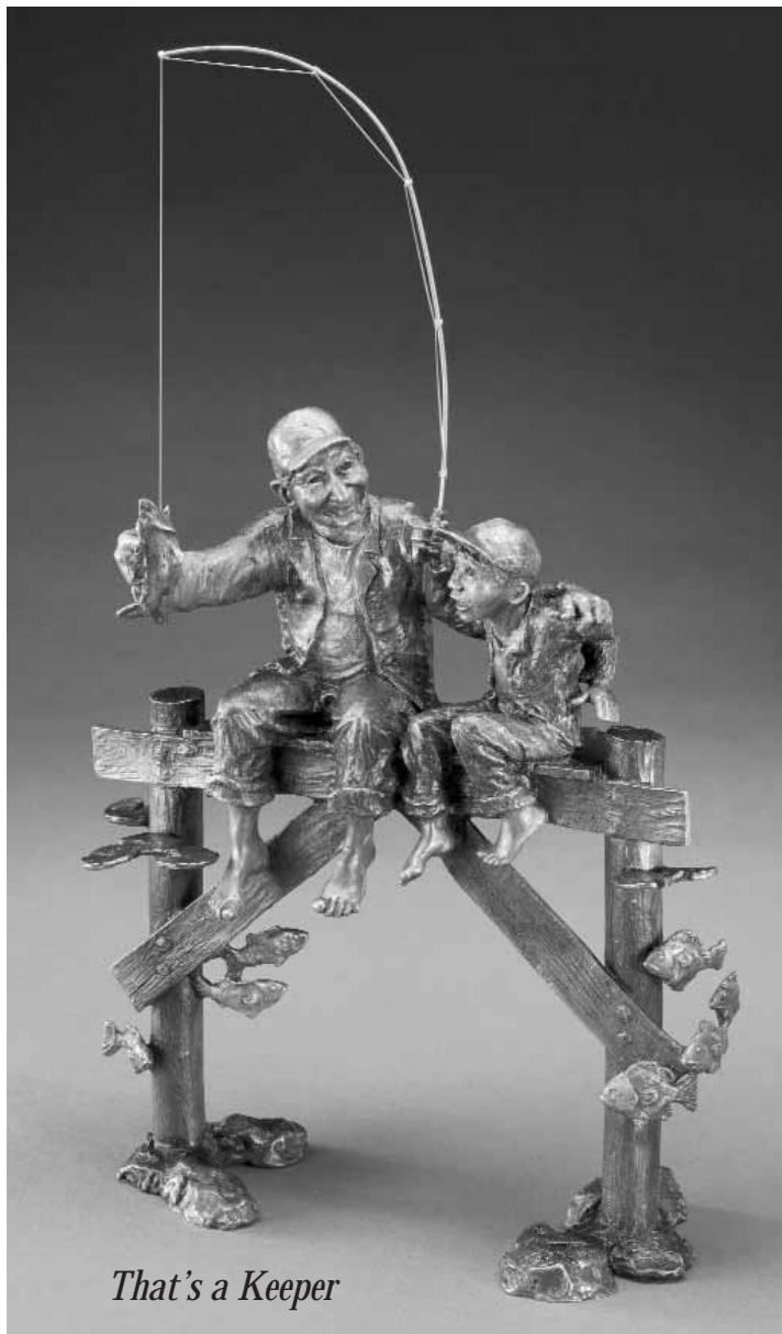
That's a Keeper