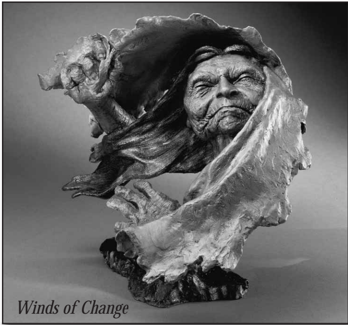
Winds of Change