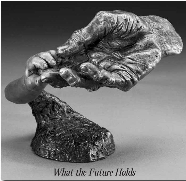
What the Future Holds