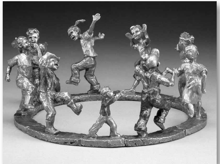
"Wait for Me!" Collection—shown as a complete set