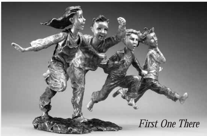
First One There